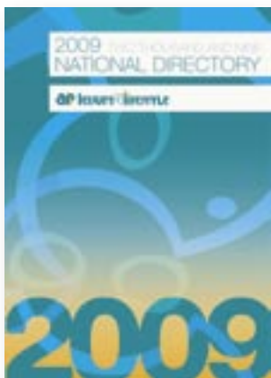
2009 National Directory