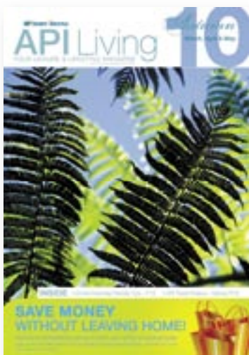
Bi-monthly member magazine, API Living